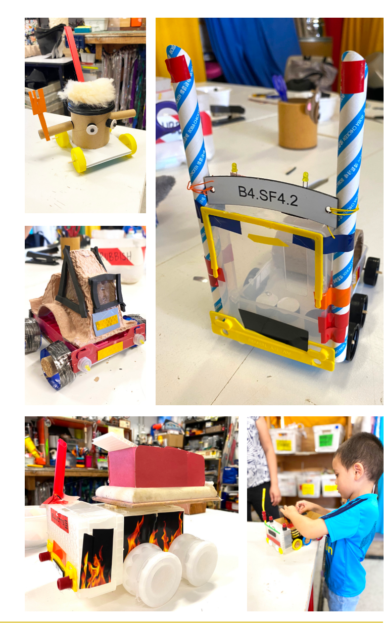
Thank you for helping RGQ to save approximately 2 tonnes (2,000kg) of industrial discards from landfill every week.