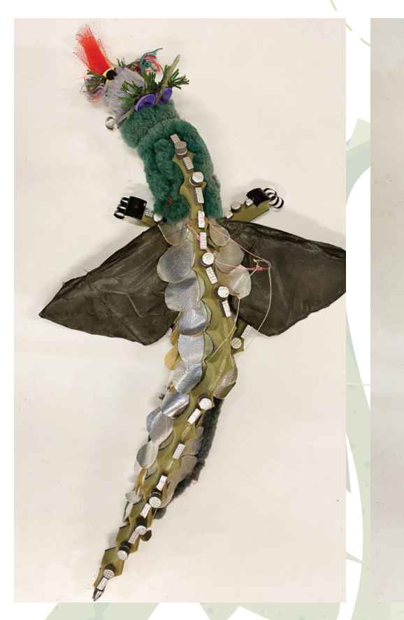
This dragon is soft, cuddly and can be hung from a tree.

If you'd like your dragon to hang from a tree, what can you use to reinforce the body so it doesn't sag once it's supsended?